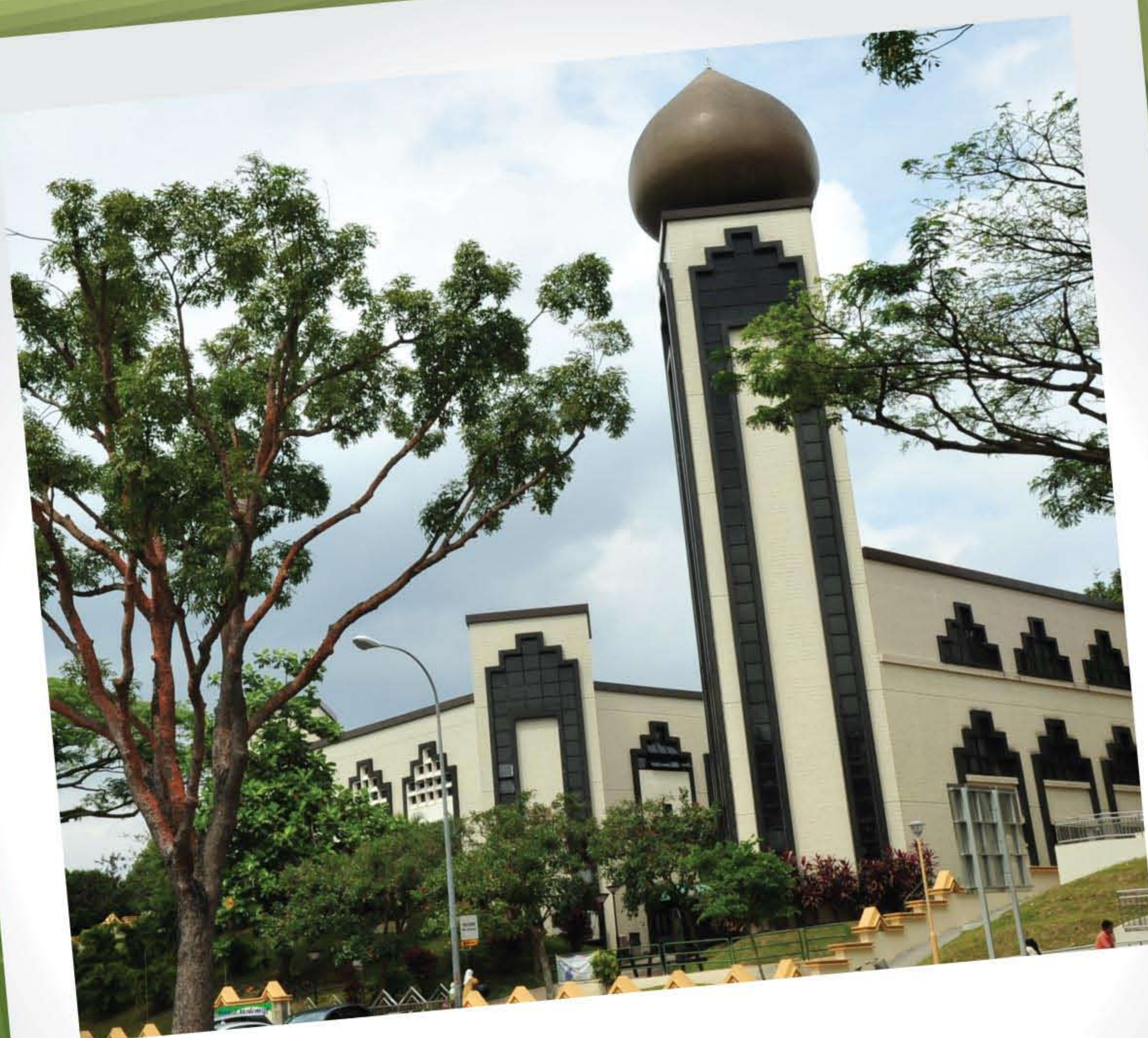
Masjid Darul Makmur

This mosque was built in 1987 by the Muslim residents of Yishun to serve their spiritual needs. Today it is a hub for the Muslim community in Yishun.