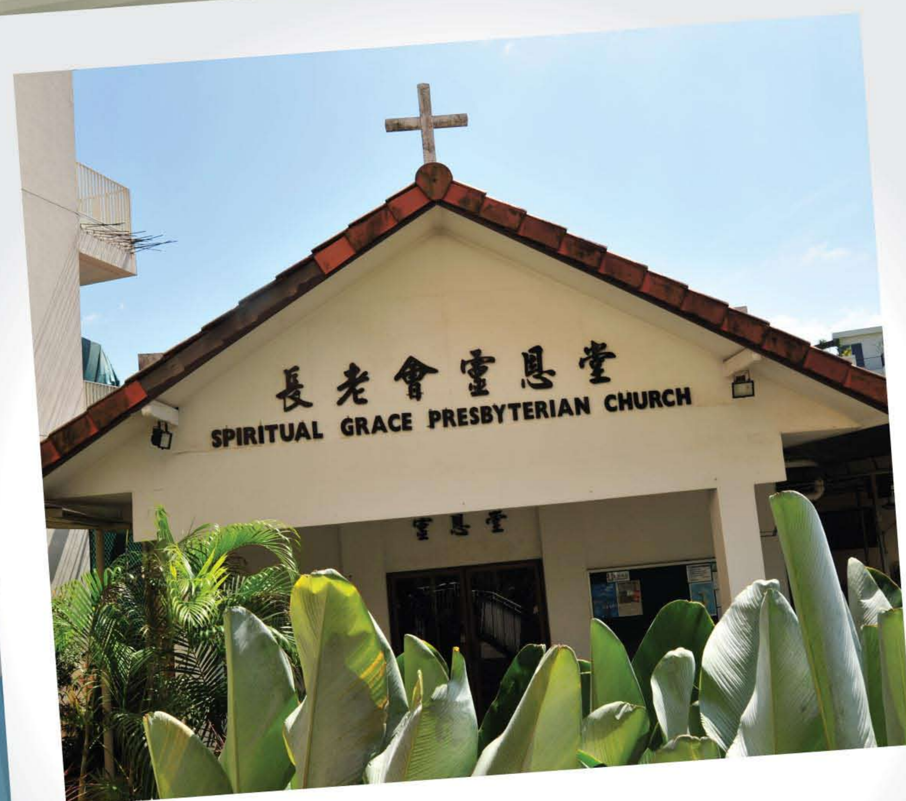
Spiritual Grace Presbyterian Church