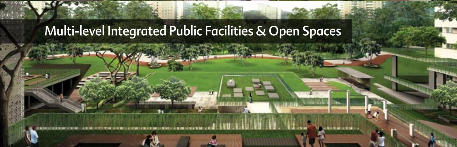
Multi-level Integrated Public Facilities & Open Spaces