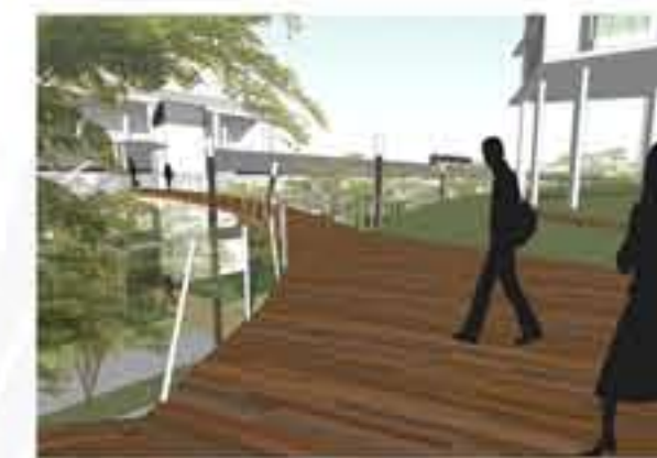
Adrian and Olivia making their way to work

Inspired by the 'jambatan' decks of the Kelong kampung where pedestrian traffic is separated from the water vehicular traffic below, Eco-walk negotiates the distinctive landform by providing a layer of upper level connectivity. This links transport nodes such as the LRT to the precinct, its social/activity nodes to the waterfront, as well as in and about the surrounding neighbourhoods, integrated into the design as a series of gentle ramps and generous footpaths. Eco-walk provides friendly seamless accessibility, Eco-walk also doubles up as roofs of SCF, linkways and entrance features. This enables users of all ages to navigate and safely explore the precinct and use its facilities on foot or on bicycle, uninterrupted by the vehicular traffic traversing below.