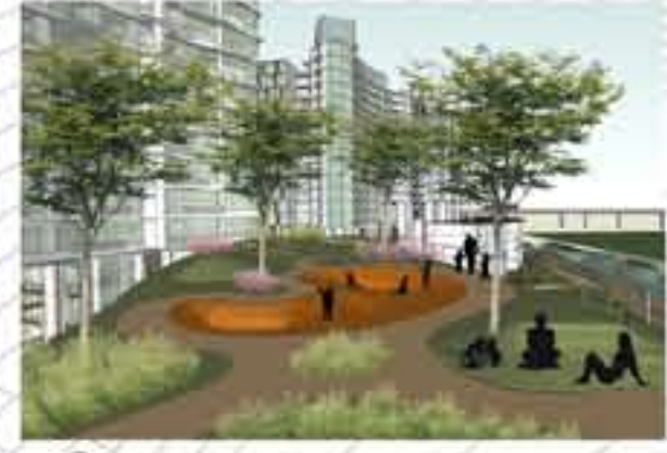
The Mok family catching up on the past week's happenings with each other over picnic.