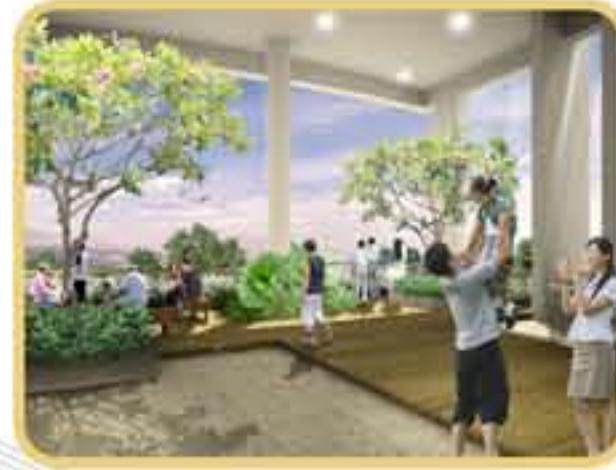
Sky Deck - Where the community connects