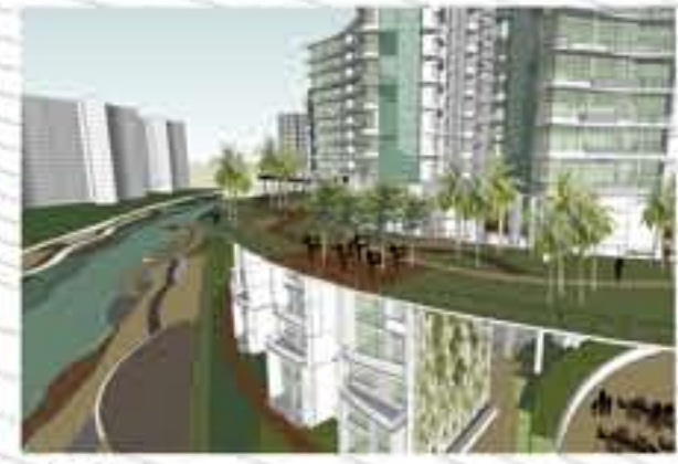
Homemakers practicing yoga by the waterfront.

Eco-walk encourages community bonding by enhancing the overall social/activity node network. From a physical connector, it transforms into roof gardens above the loft units, which provides all-day semi-public passive social/activity spaces overlooking the waterfront. Along the typical residential blocks, the Eco-Walk also provides pockets of spaces conducive for intimate conversations or individual contemplation.