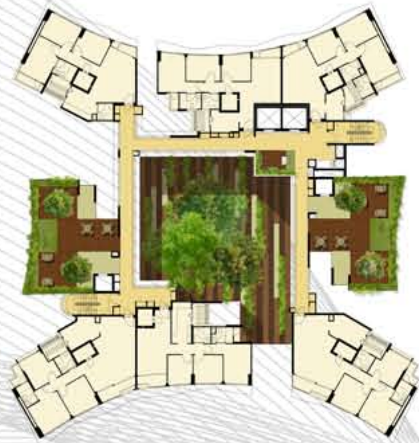
Courtyard Block Typical Plan