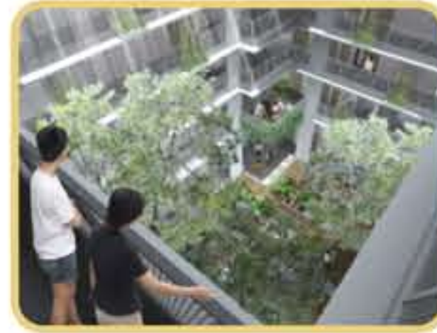
Morning social activities around the green courtyard