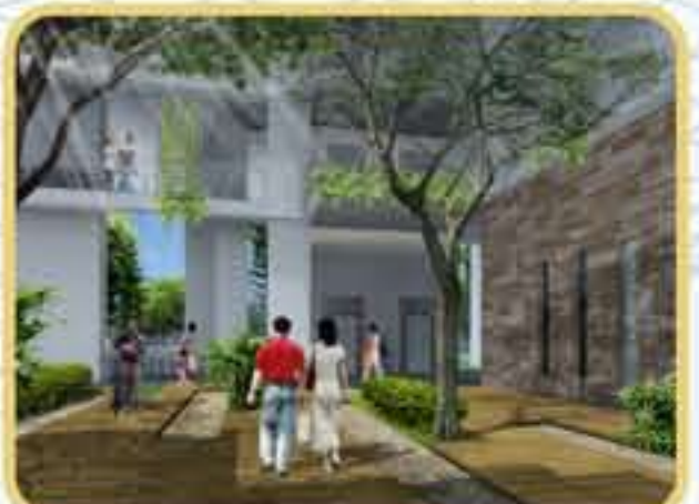
A cooling and relaxing walk home in the cozy embrace of the lush courtyard