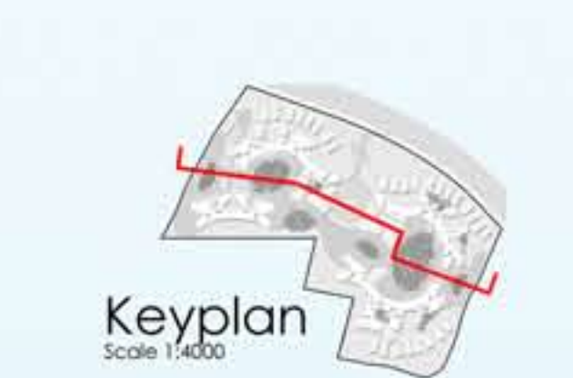
Keyplan Scale 1:4000