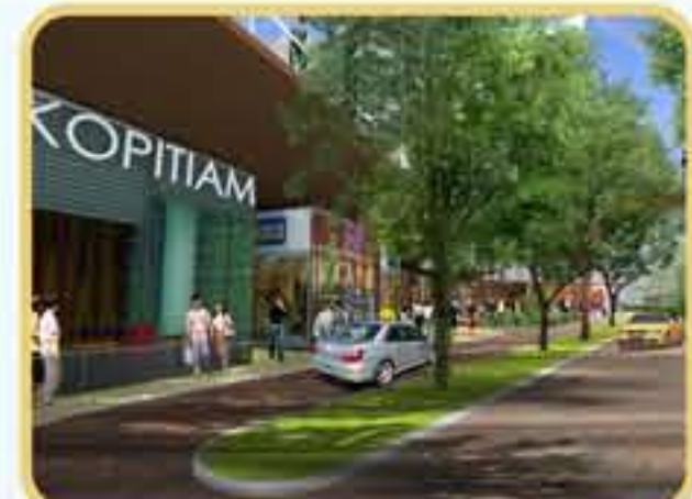
Rustic sense of arrival along Canopy Drive and vibrant commercial activity for residents' convenience