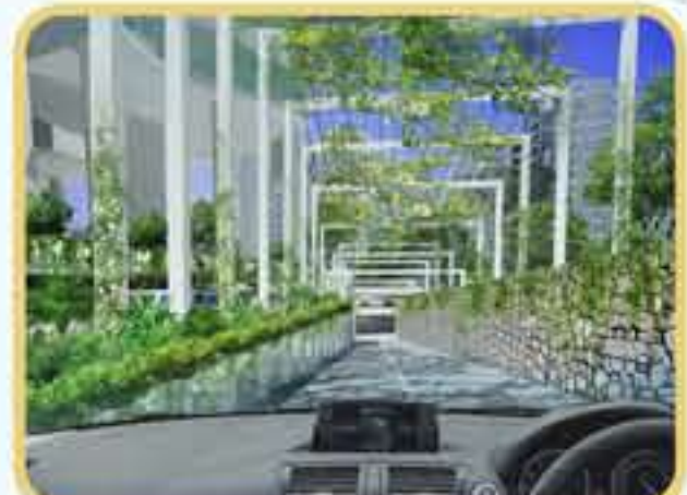
Sensory journey along Trellis Drive