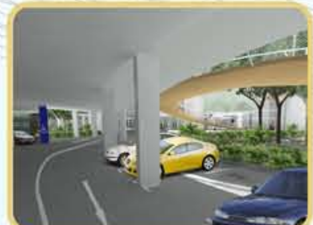
Convenient, legible, safe and comfortable car parking with ample natural light and ventilation for all users