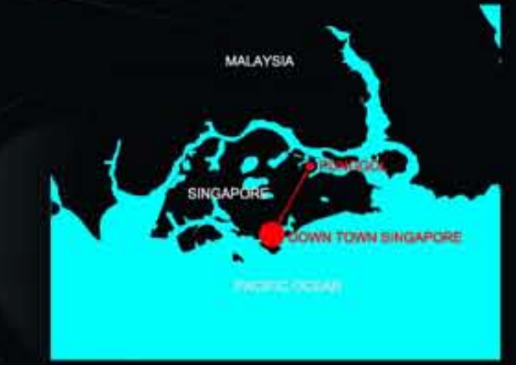
PUNGGOL SITUATION PLAN