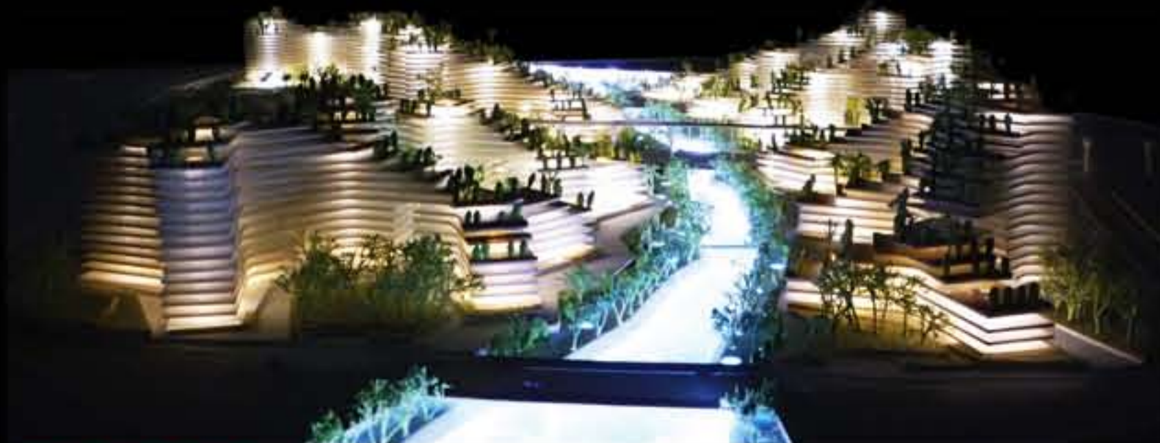
VIEW FROM THE RIVER