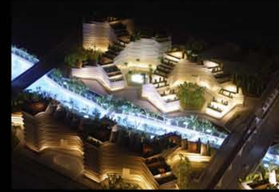
VIEW AT THE TERRACE GARDEN