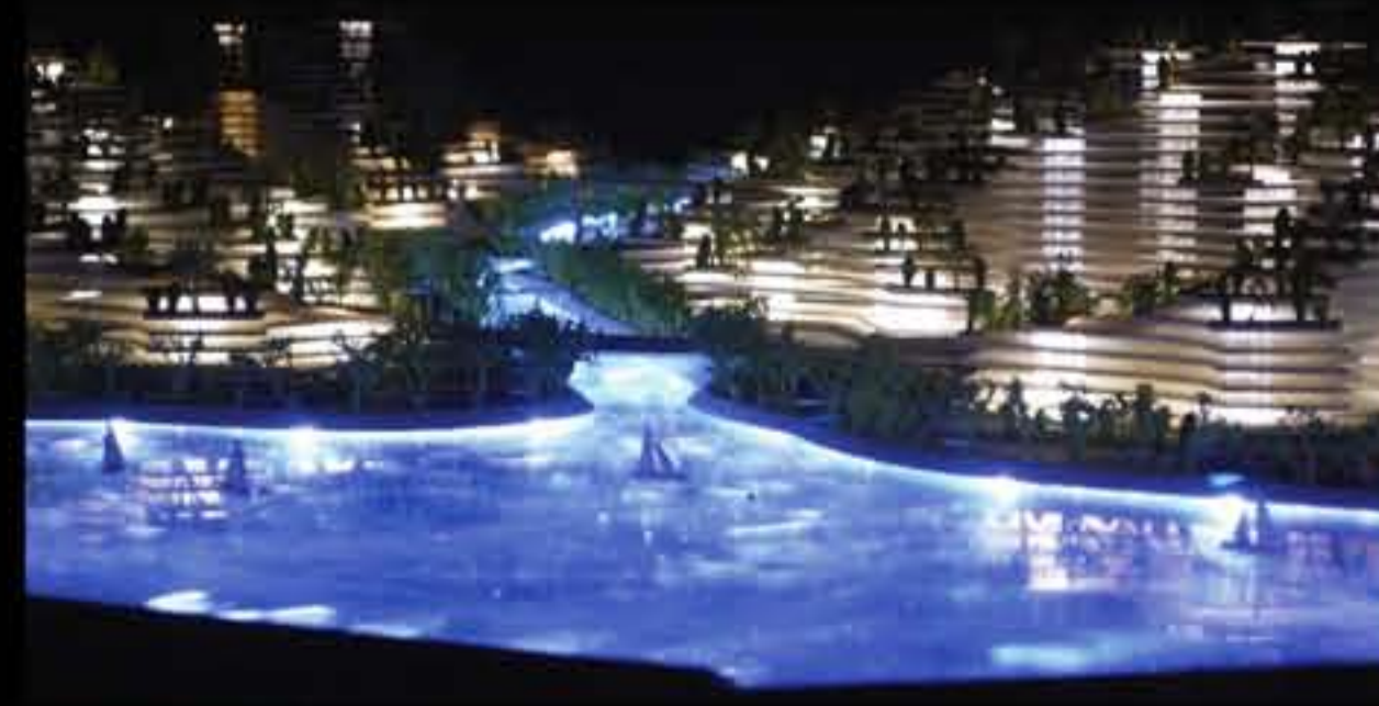
VIEW FROM THE CANAL