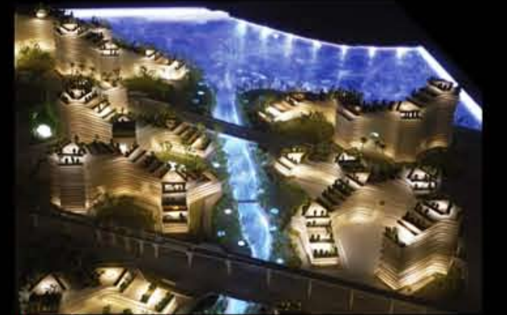
VIEW AT THE SIDES OF THE CANAL