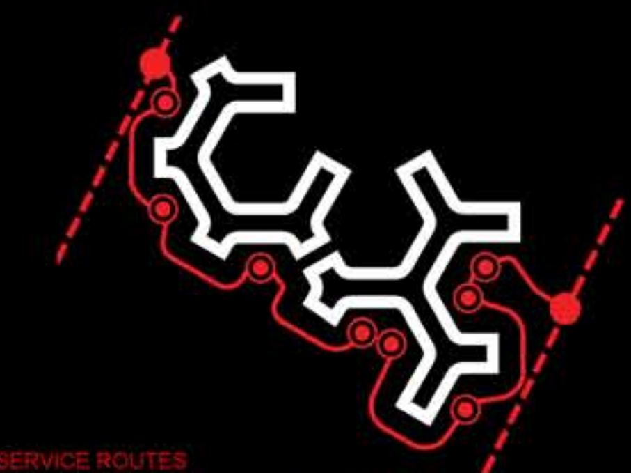
SERVICE ROUTES (FIRE ENGINE/REFUSE COLLECTION/TAXI)