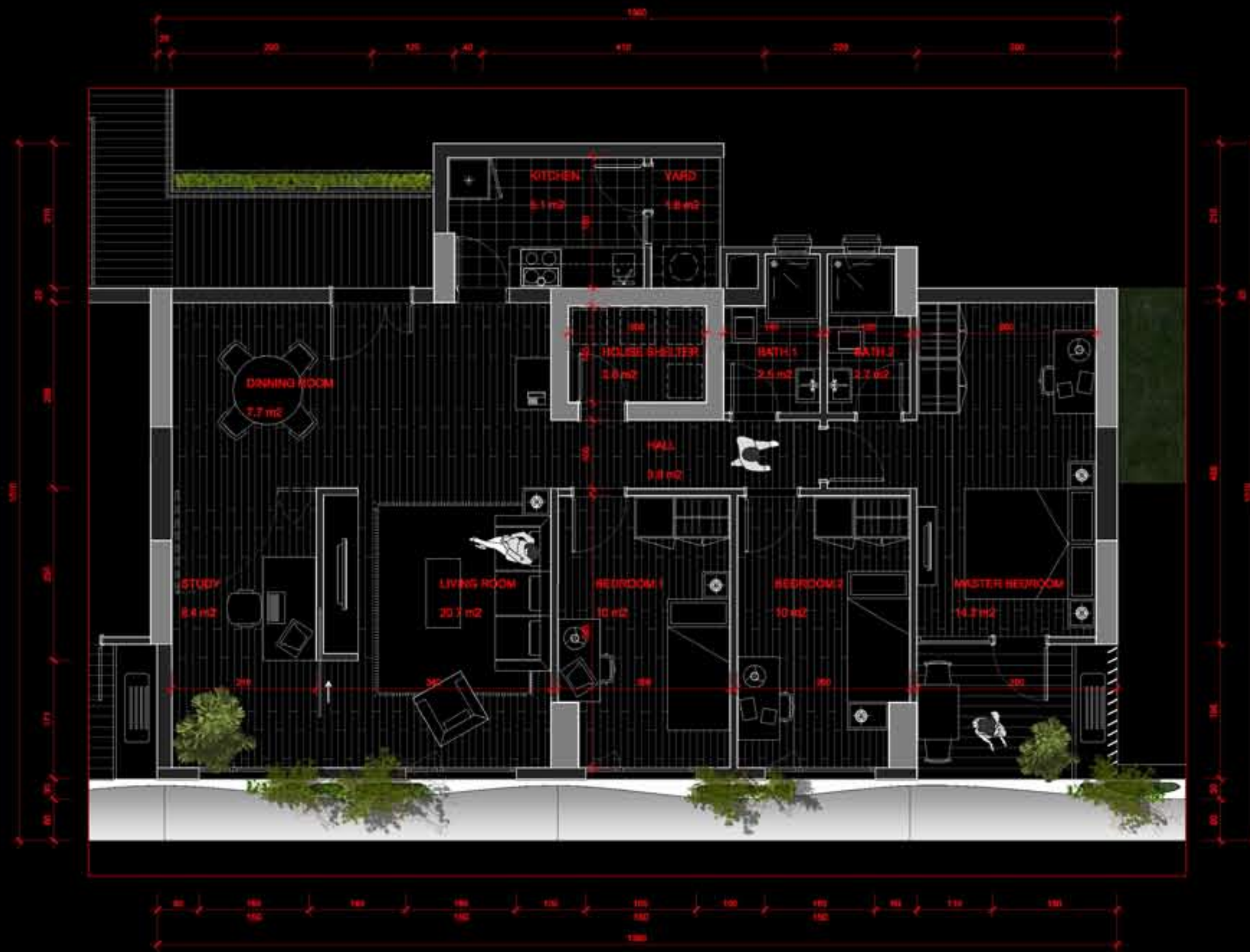
TYPOLOGY 05_"STUDY ROOM" OPTION_1:50

The dwelling units are designed to fully enjoy the views. All of the day used rooms have obstacle-free views toward the canal, the jungle or the palm gardens. The large horizontal windows give priority to panoramas and generously bring daylight into all the rooms. The day/night zones are clearly defined in each apartment and on full height of the building to maintain good acoustical comfort for both day or night activities. All main living spaces have direct nature contact so that the cross ventilation is omnipresent in the units. Further more, each master bedroom can enjoy even more the nature with its own little green terrace.