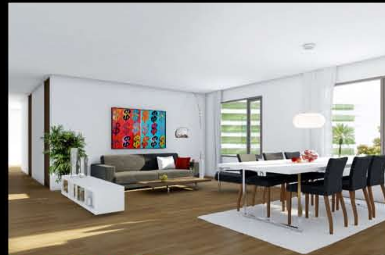
TYPOLOGY 05_"CURRENT" OPTION