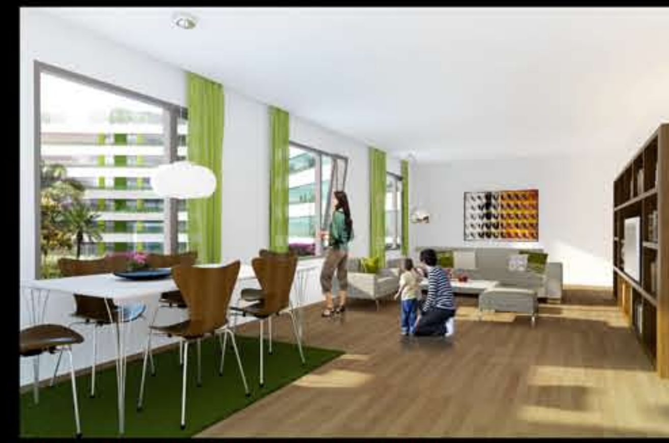
TYPOLOGY 05_"KING SIZE LIVING ROOM" OPTION