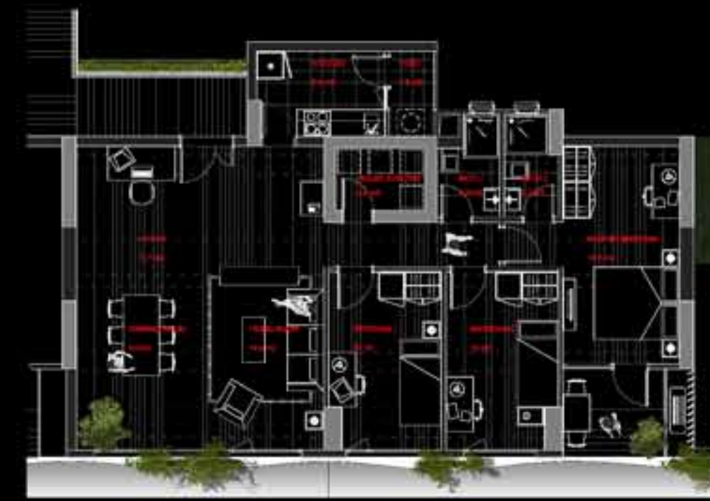
TYPOLOGY 05_"CURRENT" OPTION_1:100