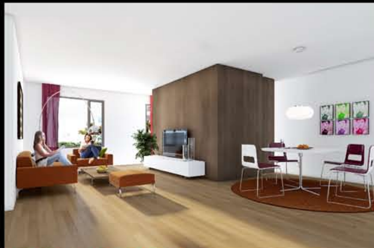
TYPOLOGY 05_"STUDY ROOM" OPTION

The dwelling units gives large choices of use and modification with the family generation development. Young couples can plan a F5 as a loft, then adjust a room and an office when they have their first child, and finally turn it into a full function F5 whenever they want, to adapt to their life evolution and work style. The dimensions of the rooms are adapted for various arrangements so that each family could freely create their own living environment. For example, a desktop computer or a reading loft may be planned next to the main door following each's desire. A dressing space or a make up table may be available at the end of the master bedroom. These examples show how the apartment is designed to be customized and to adapt to each resident's life style and desire.