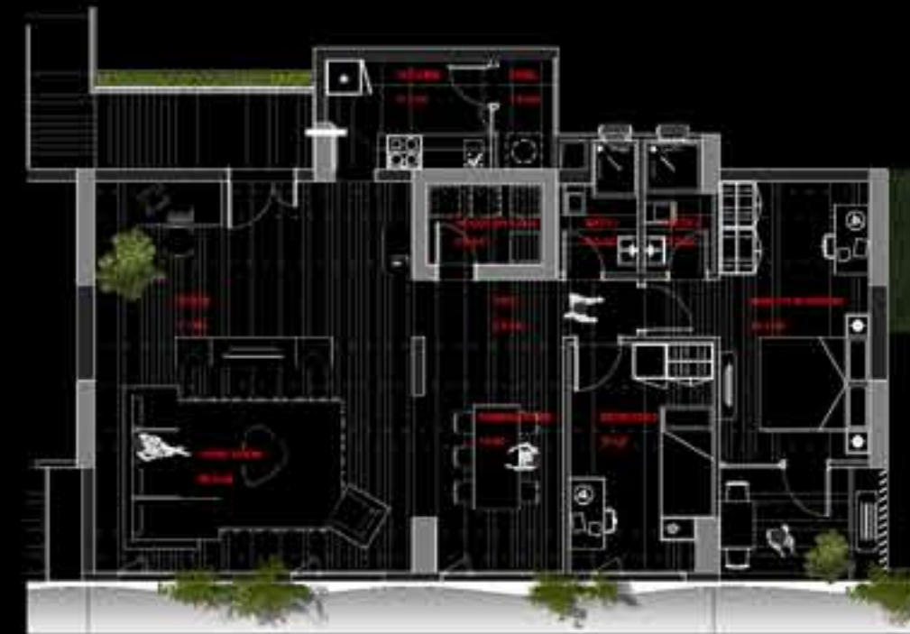
TYPOLOGY 05_"KING SIZE LIVING ROOM" OPTION_1:100