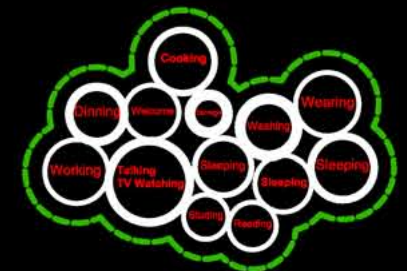
INTERIOR APARTMENT LIFE