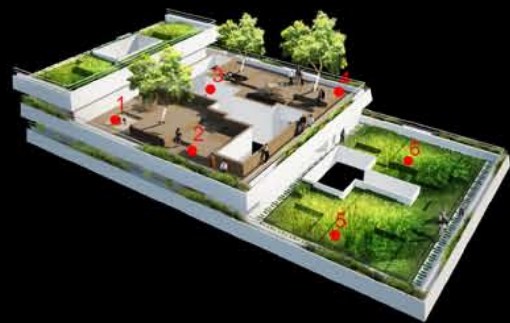
PUBLIC ROOF TERRACE (RESIDENT USED)