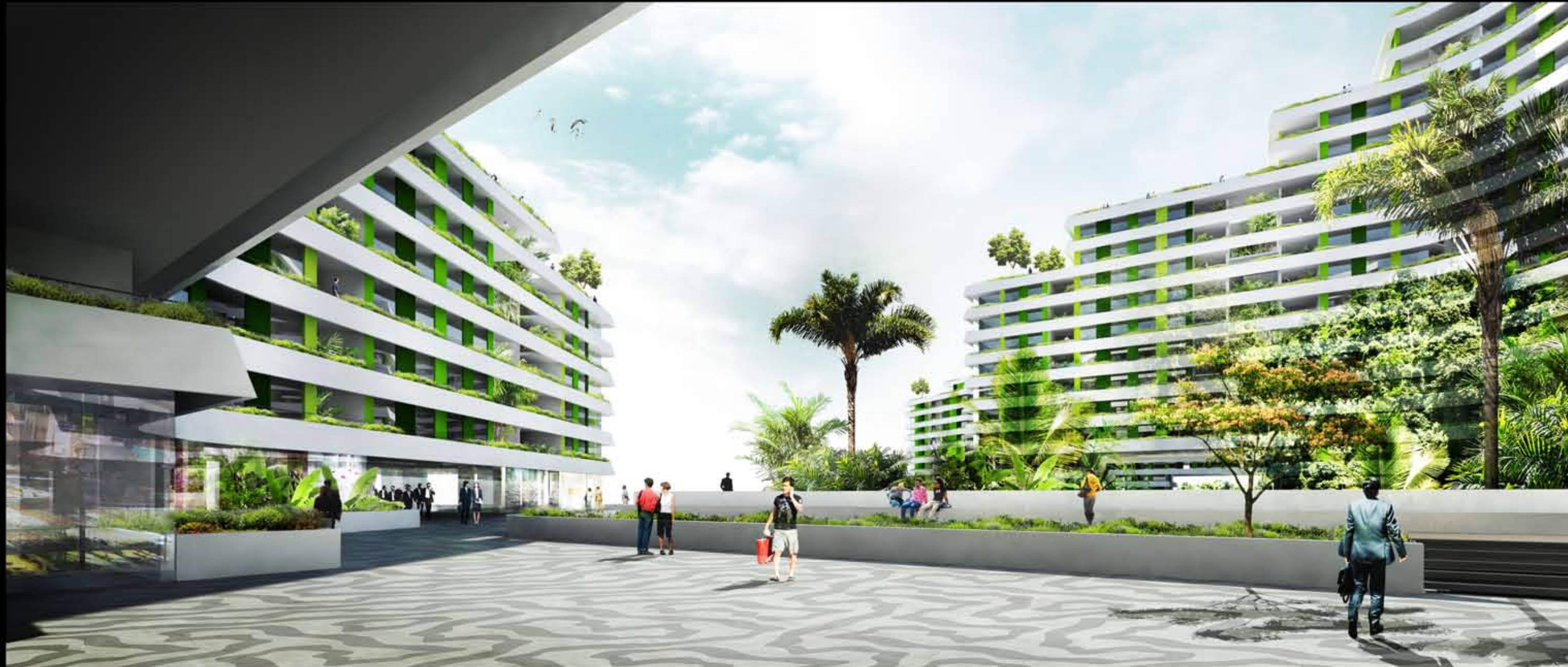
EXTERIOR VIEW COURTYARD AND COMMON GREEN