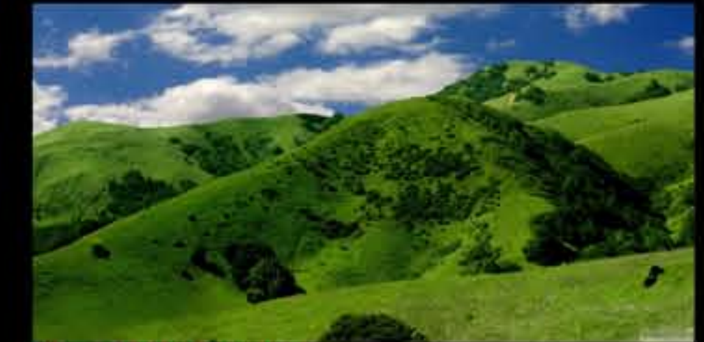
GREEN HILLS SKYLINE

One of the joys of living in Singapore is that you are never far from nature, you are surrounded on all sides by a lush verdant tapestry. With this project we try to bring this closeness to nature into the living spaces. Extending the lush vegetation vertically into the building, with sky gardens, planters and roof-top terraces, we create a three dimensional tropical oasis within in the urban fabric. Locating the car parking under the podium deck and moving away from the traditional tower block format we free up more space on the ground floor for exciting and functional green spaces. With large voids into the car park we also bring the greenery down to the lower levels. The proposed canal to the north of the site gives us opportunities to link to the wider urban form and landscape, visually and physically. By tiering our landscape down to the level of the canal we create opportunities for interesting landscape interactions, additional spaces for landscape facilities and a buffer to provide privacy and security for the residents.