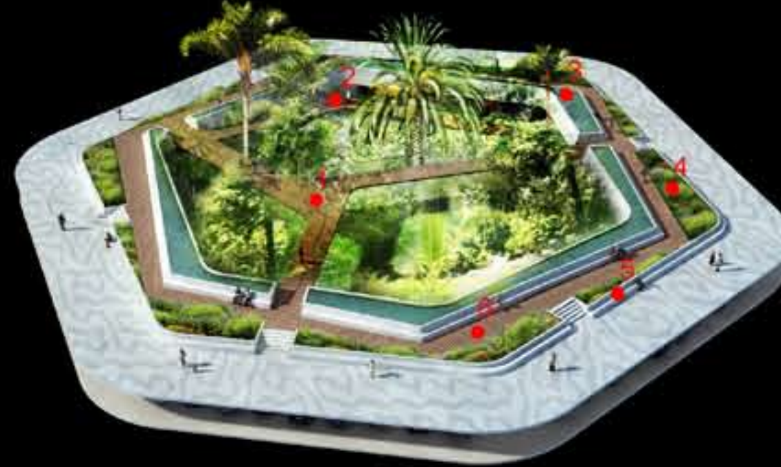
COURTYARD (PUBLIC AND RESIDENT USED)