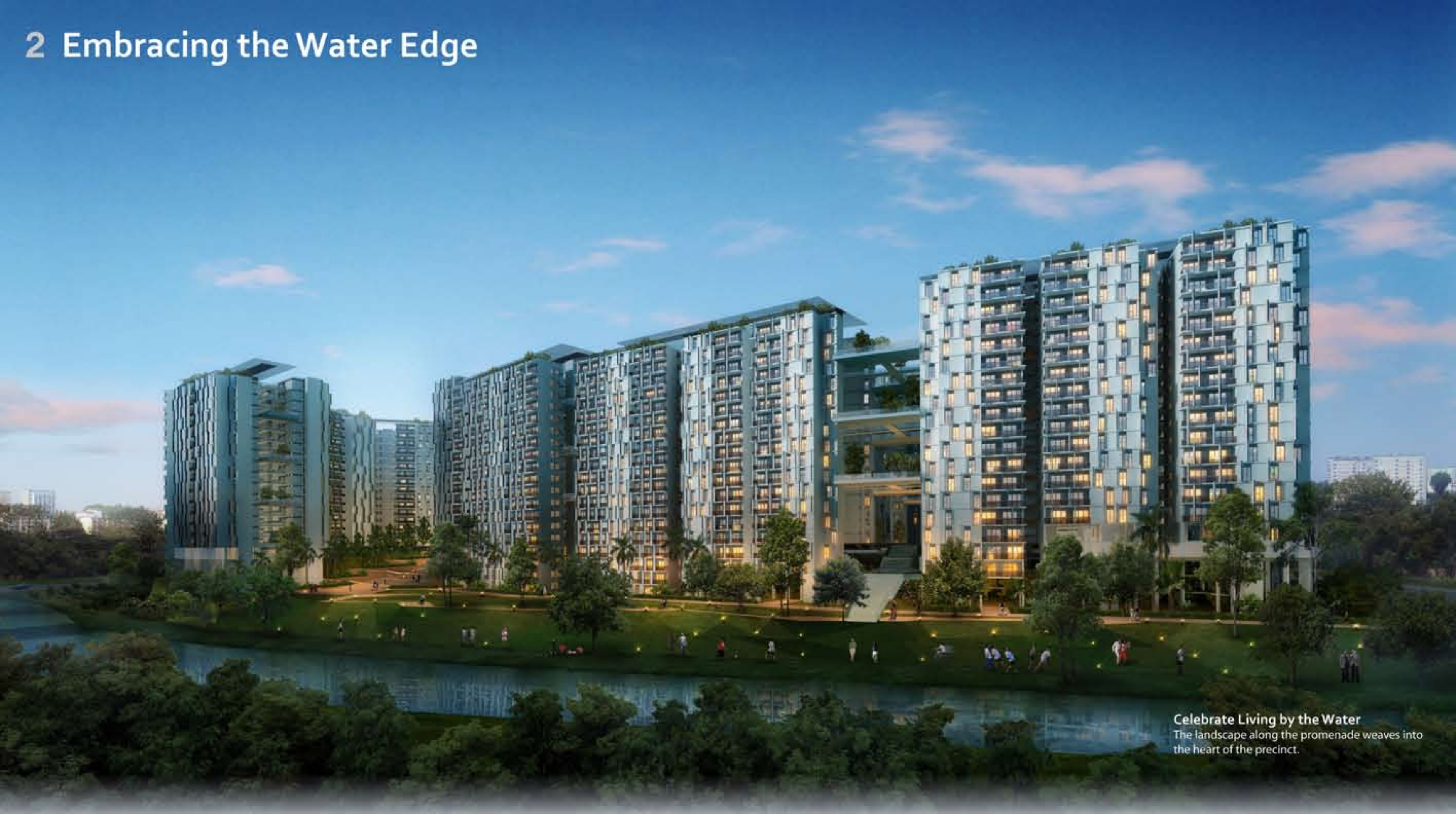
Celebrate Living by the Water The landscape along the promenade weaves into the heart of the precinct.