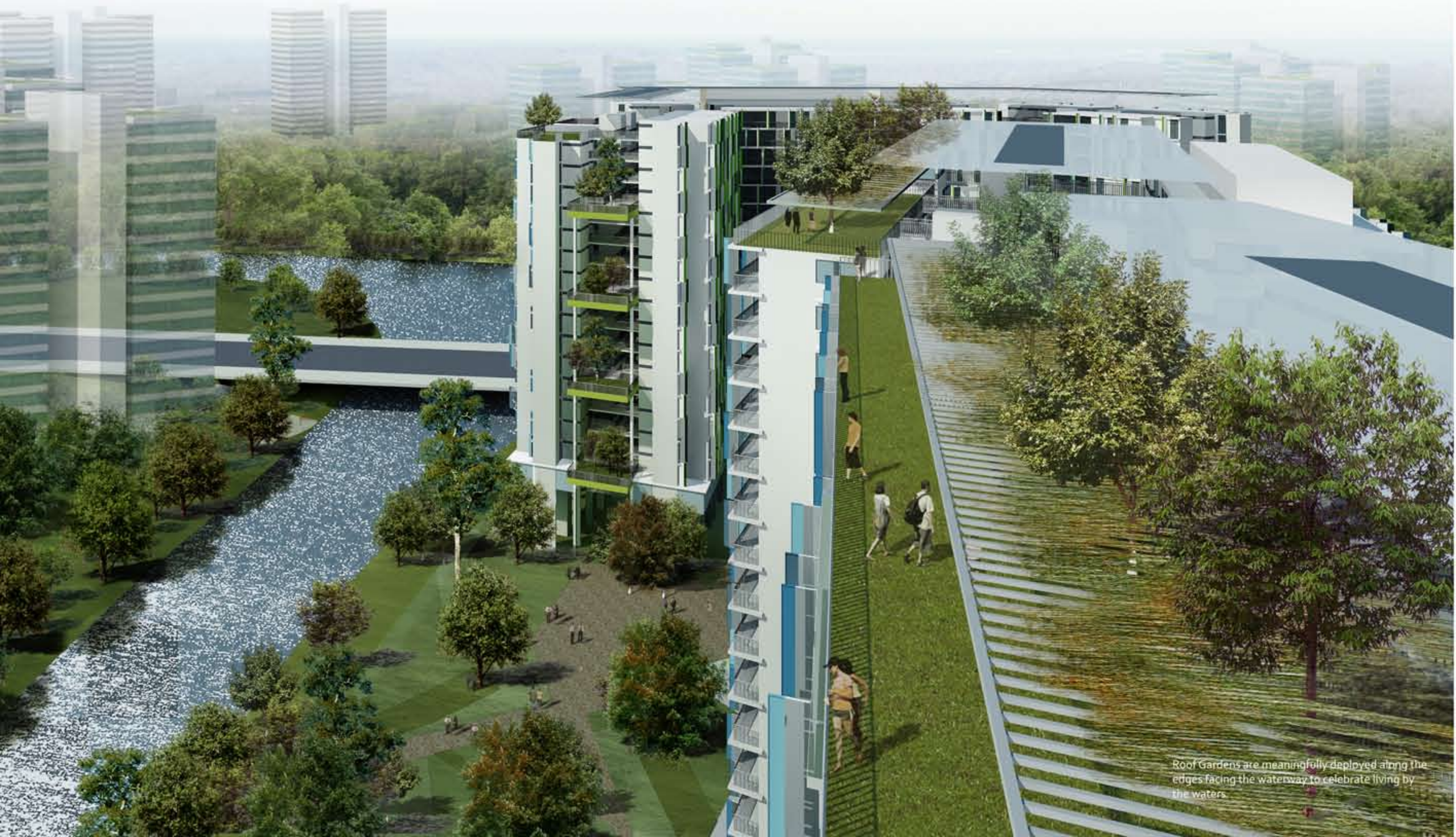
Roof Gardens are meaningfully deployed along the edges facing the waterway to celebrate living by the waters.